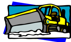
Street Cleaning: 2"