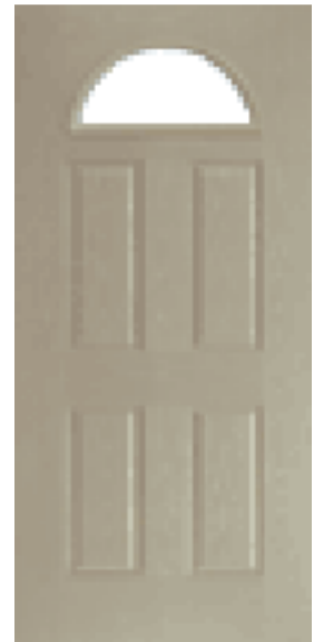
Fan Light-(May Also Choose Arch Top Fan Light Not Shown)