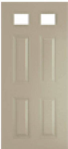
Twin 8x6 Colonial Light