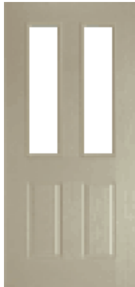
Twin 1/2 Light